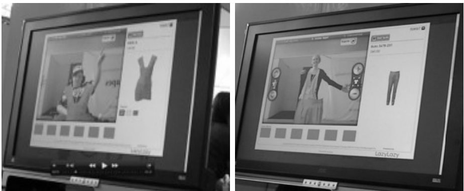
Fig. 2. Current UI problems (left; height/handedness) (right; distance view/operation)

Figure 2 (left) illustrates a participant who was in a wheelchair, which placed him lower in the picture than other participants. As a result, he could not reach the button at the top. He used solely his right hand to make selections, which provided difficulties when trying to reach the buttons on the left side of the screen. Younger children had similar issues with reaching as they were also positioned lower in the picture (due to their height). The figure 2 right image illustrates a participant who was standing too far away from the camera, which was necessary in an attempt to see her lower body and she selected to preview trousers. As a result, she had trouble reaching the buttons at the sides of the screen and the image was too small because of the distance. Figure 3 (left) illustrates how the participant had difficulties interacting with the system because the buttons were activated by motion (of other people) in the background. The right image (figure 3) illustrates persistent single-handed interaction and body twist to operate, even though participants complained it uncomfortable.