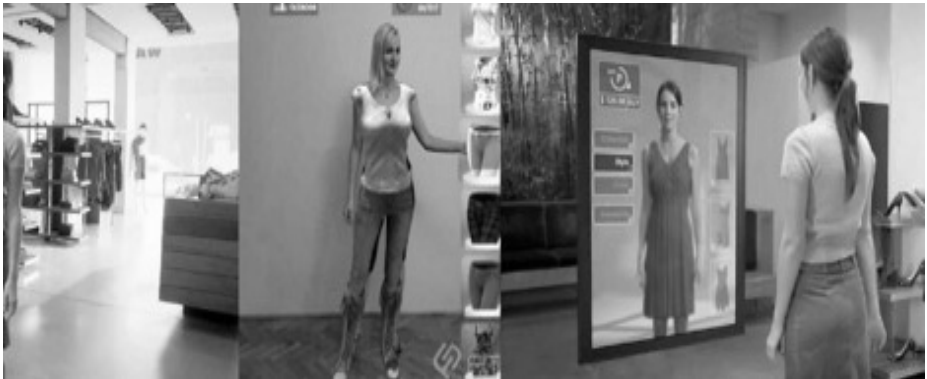
Fig. 1. Different state-of-the-art virtual dressing room solutions questioned

apparel purchasing system were seen as key factors for wheelchair-bound consumers. However, it is clear that the UI needs to be adaptive to overcome challenges such as illustrated in figures 2 and 3 that highlight interface/setup design considerations.