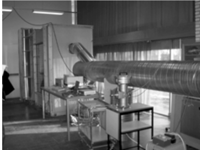
Figure 2. A photograph of the wind tunnel setup used for the experiments at Aalborg University. The large inlet to the far left followed by the chamber with a window; manikin and the two exhaust holes in the back with ventilation ducts.