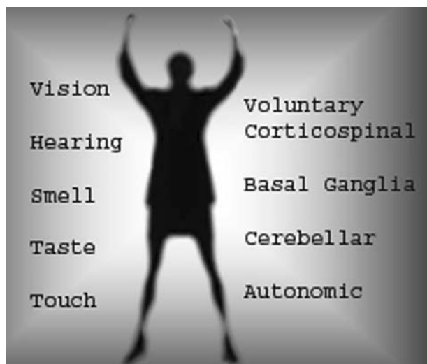
Fig. 1 Afferent efferent loop closure

synchronized to physical gestures without encumbrance from worn body attachments or wires. Coding was focused on the actions involved in the interaction, i.e., the initiating physical gesture of the child, the corresponding movement response of the robotic device, and the child's facial expression resulting from the stimulation. The sensor based system can be thought of as a tool that targets implementation in therapy training. Fagan [12] suggests that 'using a tool' exemplifies such affective transformation. Accordingly, this paper focuses on the use of an interactive robotic device as a "tool" for therapists to utilize towards the yielding of beneficial effects in their training sessions.