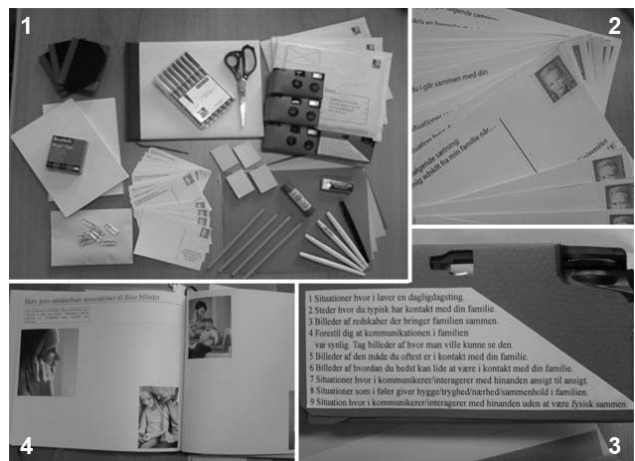
Figure 1: 1: Contents of the Cultural Probe. 2: Postcards. 3: Disposable camera with suggested ways of use. 4: Assignment in scrapbook

The purpose of this study was to understand and describe the ways that intimacy expresses itself within families and especially between children and parents. We chose cultural probes and contextual interviews in order to be unobtrusive and to reveal tacit knowledge. As suggested by Gaver, cultural probes can be used to generate inspirational responses and make the informants reflect, interpret and express upon the domain [4, 5, 11].