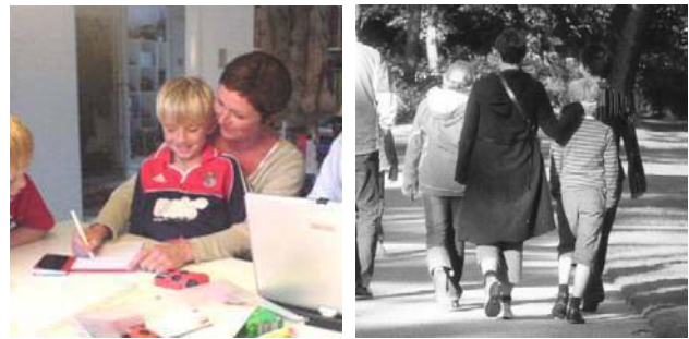
Figure 4: Examples of the physical aspect of parent-child intimacy, which was important in all families

Self-disclosure is the revelation and willingness to open one self to the other [20]. We found that openness in a parent-child relationship is very important from the perspective of the parents. All parents in our study expressed interest in getting information from their children. One parent stated “...when we talk we get closer, we come closer to each others lives”. On the other hand, we found only minimal evidence of self-disclosure shown from the children. They were less willing to include the parents in all their activities. Typically, the parents wanted more information from their children during the day e.g. “I would like to be a fly on the wall”. In addition, to openness we found that the parents used empathy as a mean to get information from their