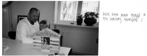
Figure 5: Examples of a play situation

Presence in absence is the sense of the other despite a physical distance [20]. We found that presence in absence for parent-child relations was related the feeling of security and trust while being physically separated. The sense of connectedness between parents and children was present in the awareness of one another. One parent expressed how he would like to be able to see his son over a webcam during parts of the day. This need for assurance of knowing where their children were was an issue of concern for the parents. Some children used technologies for presence in absence like the older child in one family used instant messaging “Sometimes I chat with my father when I come home from school” . Additionally, one father expressed how he found the use of SMS cumbersome and difficult to use. On the other hand, he stressed the idealness of SMS when communicating while hiking in areas with unstable networks. The asynchrony of messages gave the children time to formulate messages and it enabled him to read the message whenever the network allowed it “It’s like the SMS lasts longer” . One mother pointed out how the children felt like “We have got an SMS from dad!” where SMS was a one to many channel of communication between the parents and the children.