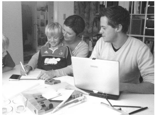
Figure 2: Interview and introduction of cultural probe

The first meeting aimed to introduce the empirical study and deploy the cultural probes. An introductory meeting was held in the homes of the families. We introduced the