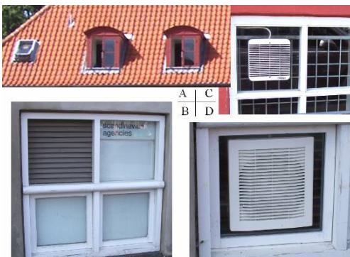
Figure 9 some ventilation modes in Aalborg

Ventilation is an important function of windows. When the temperature, humidity and cleanness of outdoor air are beneficial for the indoor climate, natural ventilation is the best way to be used (see figure 9-A). Whereas, when the enthalpy difference between outdoor and indoor air is not fit for natural ventilation, it's an effective measure to tighten windows and reduce the air infiltration, thus to reduce the energy consumption by windows [6] . In this situation, for a basic provision of fresh air, the mechanical ventilator was developed, see figure 9-B, C, D. It both reduced the impact of disorganized natural ventilation on the indoor climate and satisfied the hygiene requirement of IAQ. The EU new requirement of energy efficient in buildings demands that the air infiltration must not exceed 1.0 L/s.m 2 at 50 Pa pressure differences, which corresponds to an average air change of 0.1 h -1 .