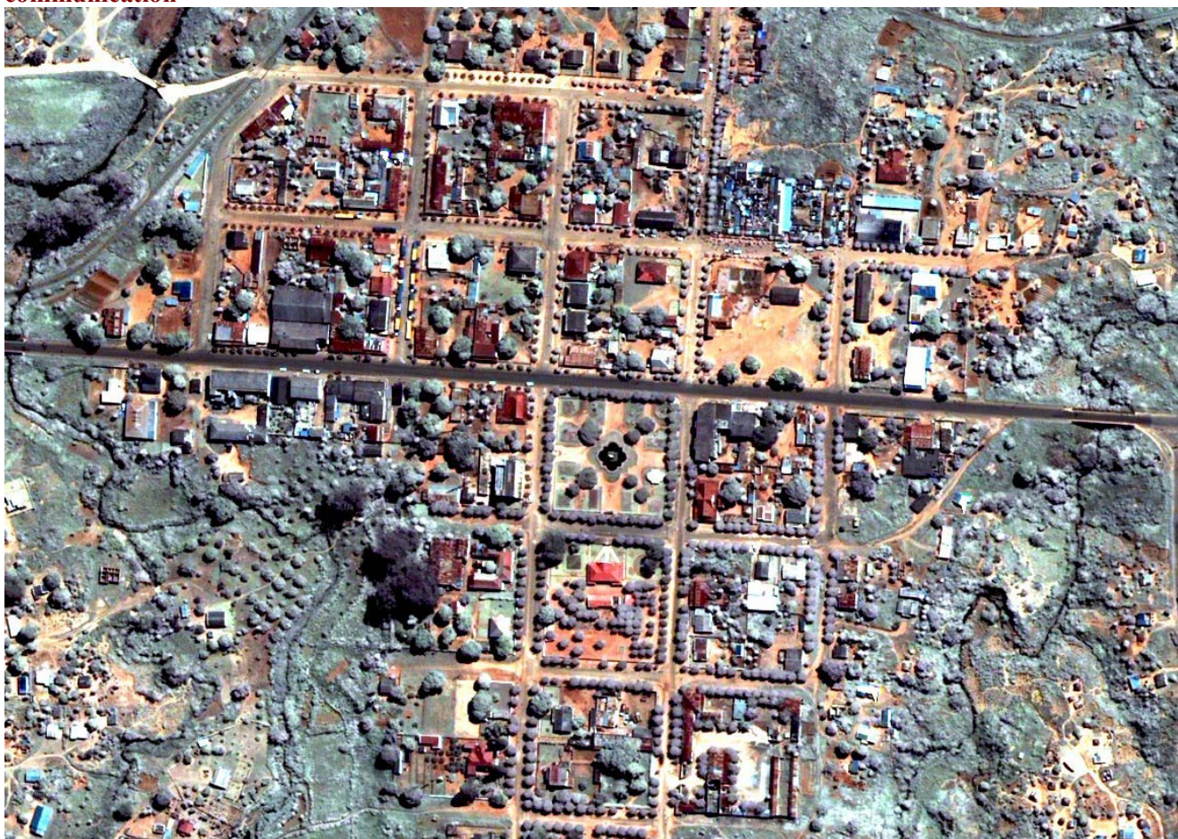
Figur 2 Satellite image map

The Photo-map is for land administration and land tenure reform, what the mobile phone is for communication