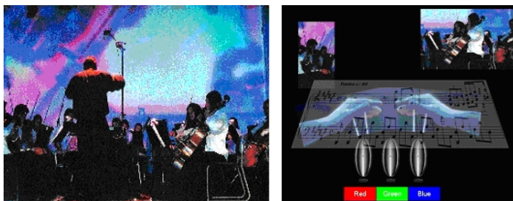
Figure 1. New Zealand – Four Senses: Conductor is the main generator of motion data from within three infrared sensor zones that are mapped to Red, Green, and Blue animation sequence filters.