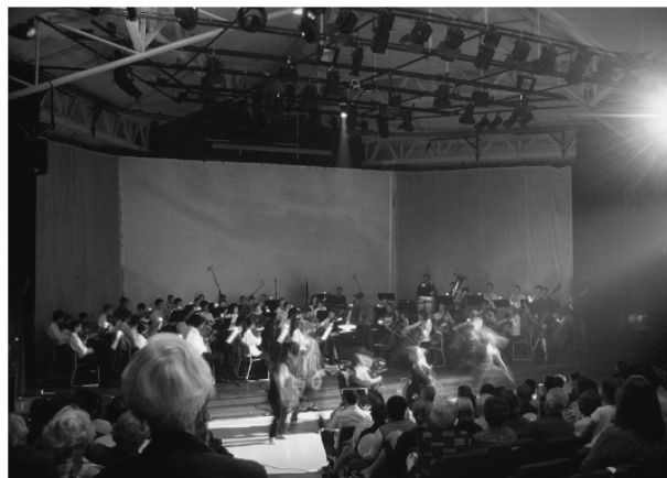
Figure 2. New Zealand – Four Senses: Aotea Youth Symphony and Touch Compass dancers generate inter-sensory stimulation data to affect the experience of classical music for deaf audience members.

communication network of headphone/mic walkie-talkies. These various stage signals served a switching bay that was created with a bank of video monitors to observe image signals. Downstream were video mixers which then served 5 computers (Mac & PC) and following a final manipulation of the material it was blended to feed seven powerful projectors that were sponsored by Epson New Zealand. A sizable foyer installation was additionally setup on large bubble wrap where a “mini performance” featured the Touch Compass dancers triggering/controlling their own video image feedback & sound via the sensor/camera system. A sponsored Epson printer enabled shots of the dance to be printed and freely given to the audience.