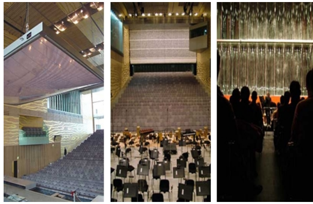
Figure 5. Casa da Música – main auditorium architect features to consider in design.