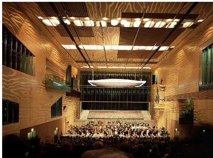
Figure 3. Main auditorium and venue for the event at Casa da Música, Porto.

According to the specific situation and the profile of the participant(s) and/or audience, decisions are made whether innate design parameters of response manipulation should be directed toward targeting a goal via the feedback content design, the input device programming, or input device physical setup. Alternatively a less complicated, freer content may stimulate the desired goal reaction without calibrations etc. In the preliminary stage of the research presented on this occasion we target an abstract interpretation where performance data controls the audience visual experience. Figure 3 illustrates the spectacular auditorium which is the venue where the situated opportunity to create for Orquestra Nacional do Porto will take place.