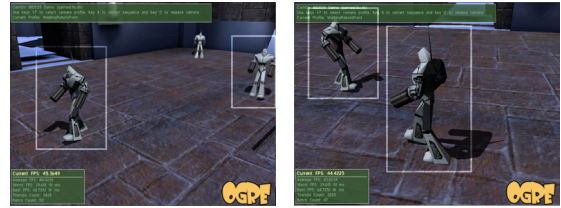
(b) Robots facing same direction (c) Robots facing opposite directions