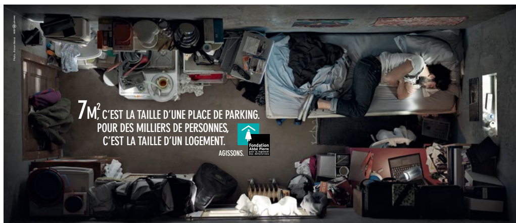
"7m 2 is the size of a parking space. For thousands of people, it's the size of their home."

We try to insist on dignity and universality in our campaigns.