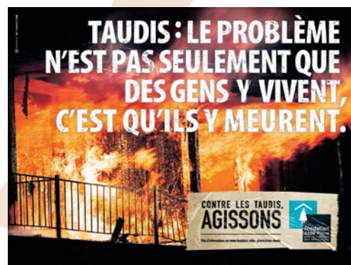
"The problem with slums isn't just that people live there. It's that they die there too."