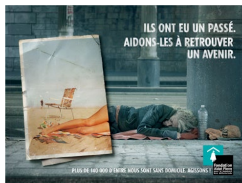
"They had a past. Let's help them have a future".

As a charity, Fondation Abbe Pierre receives only private funding, coming from ordinary people (about 400,000 persons each year). Half of the donations are given in December: the first low temperatures and "Christmas spirit" stimulate sensitivity to homelessness, making it the perfect time to raise awareness. This is why, each December, we launch a large-scale poster campaign combined with a video clip. We try to insist on dignity and universality in our campaigns. The simple, long-term message is "you don't need to feel guilt or pathos, just remember that we are all the human and we can't let some of us freeze to death". We have partnerships with bus companies, advertisement companies, TV channels and others, which gives us free advertising space. We recently received an award for one of our campaigns, against micro-homes. On 12m 2 placards, parking spaces (6m 2 ) and bus stops (7m 2 ), we put posters of a micro-flat from above, saying things like "enough space for a bus stop, but not to live in". Our latest campaign showed homeless people with part of their bodies replaced by pictures from their past, accompanied by the slogan "they had a past, let's help them have a future", to stress there are no outsiders, homeless people are not the 'Other', they are people like us.