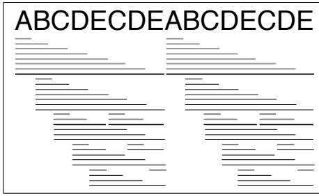
Figure 1. Patterns found in a sequence of symbols. Below the sequence, each row represents a different pattern class with the occurrences aligned to the sequence. Thick black lines correspond to closed patterns (the upper one is the maximal pattern), grey lines to prefixes of closed patterns, and thin lines to non-closed patterns.