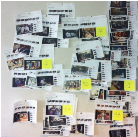
figure 3. Content map formed through content analysis of videos – categories and attributes - spatially arranged in 2D map in respect to relationship of corresponding category attributes of the videos.

Our initial data set was 169 YouTube videos comprising the search results for the keyword phrase “cooking together” on 15 November 2010, sorted by relevance. Discarding duplicates and unrelated videos resulted in a final set of 61 videos of people cooking together. The first phase in our method was a qualitative content analysis of these videos, resulting in inductive development of the following categories: video production, cook expertise, relationship of cooks, genre, content, intended audience, skill level, location, background story, mood, food role, people role, motivation . A second outcome from this phase was a content map showing relationships between the 61