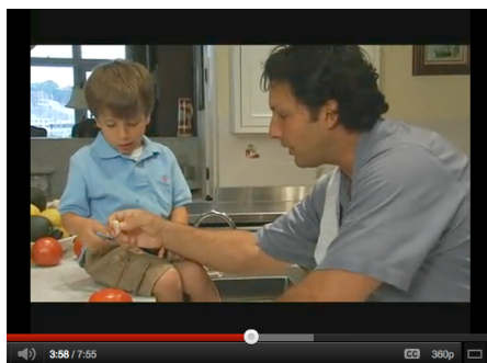
figure 1. YouTube video of “cooking together”.

By studying the natural proxemics involved in the activity of cooking together, in terms of the distance classifications of Hall [5] (i.e. intimate , personal and social ), between co-located people and the camera in the kitchen space we can understand how distance affects the sense of participation in different aspects of the cooking activity. This gives insight about how to digitally support the presence of remote participants, with appropriate distances and camera angles, so that they become part of the social experience.