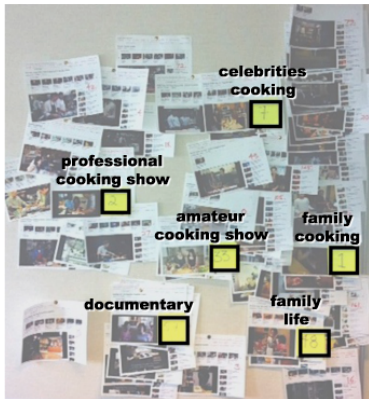
Figure 2. Content map of 61 analysed YouTube videos

The physical aspects of cooking spaces shapes the kinds of experiences people have when cooking together. As well as the natural proxemics [5] involved in cooking together, the introduction of technology creates new “interaction proxemics” [9] in respect to the cameras and display artifacts. In proxemics, intimate distance is 0-45cm, personal distance is 45-120cm, social distance is 120-360cm and public distance is anything beyond 120cm. The very activity of cooking influences the ways people locate themselves. Working side-by-side at a kitchen bench changes how people relate as opposed to working opposite each other. Facing a video camera during the interaction adds yet another level of complexity, in respect to field of view of the camera affecting the viewers perceived distance from the cook. To support their conversations, people arrange themselves spatially in different kinds of focused interactions. The F-formation (facing formation) system is a conceptual tool devised by Kendon [7] that can be used to analyse physical spaces in terms of how they support social interactions and by extension, their potential augmentation with technology