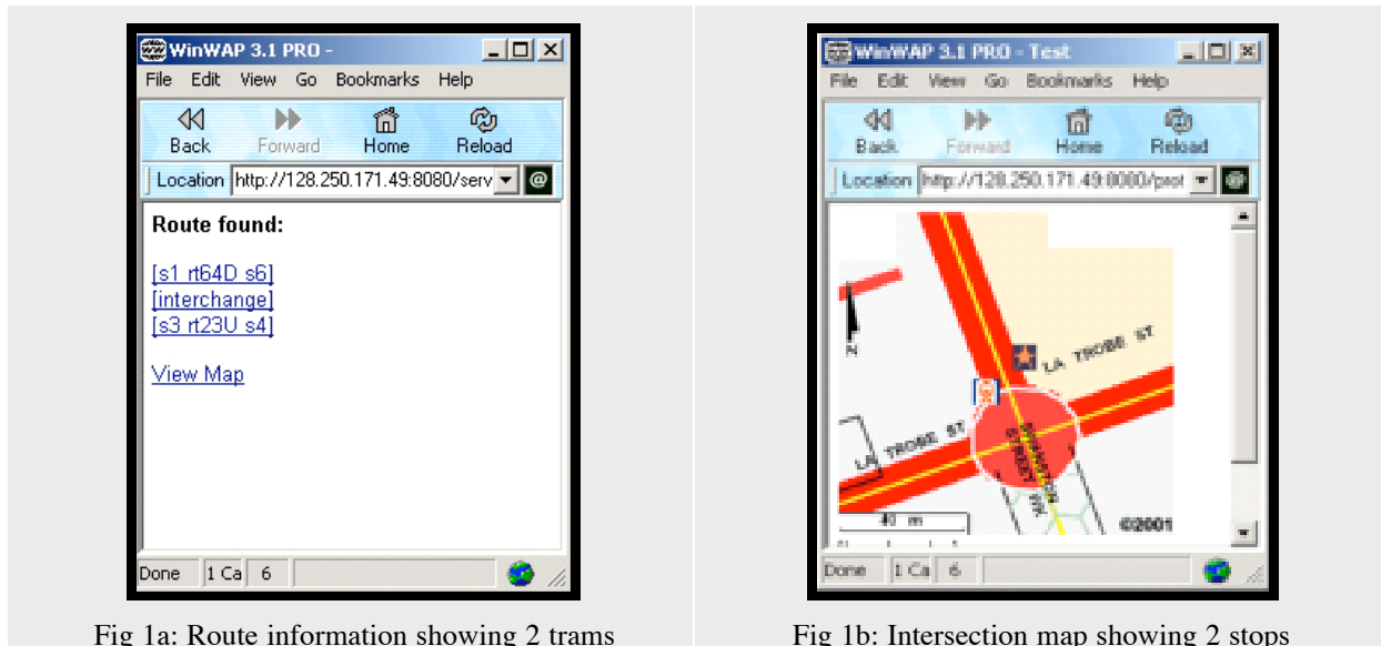
Figure 1: Two screens from Kieran’s PDA (Smith et al., 2004)

sure about his current location. He is not sure where to catch the second tram from, so he clicks on “interchange” (see Figure 1a). The display provides him with some instructions: “Disembark at the intersection of LA TROBE ST and SWANSTON ST (stop 6) and walk to stop 3 on LA TROBE ST.” He then clicks “View Map” to get more information. A map at a low level of detail appears (see Figure 1b). He knows the star symbolises where he has to disembark and the tram icon is where he has to embark the next tram. He’s a bit confused though: the second tram he has to take also seems to be on Swanston Street, except going in the opposite direction (see Figure 1b), and the system seems to be asking him to catch a tram for one stop only (see Figure 1a).