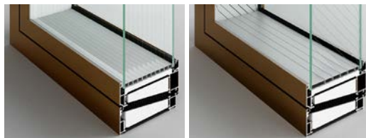
Figure 4. Cross-section of the Superwindow 160 STACK (left) and the 160 TWEED (right) [21, 22].

Multilayer all-glass products are products where the entire unit (i.e. the transparent parts) is made of glass. The traditional IGUs belong to this category. New products using thin glass layers with thicknesses as small as 0.1 mm are available on the market. Figure 4, shows two system which both have a total thickness of 160 mm and uses ten intermediate layers placed parallel (left) and in curves (right) to the inner and outer panes. The benefit of using thin intermediate glass layers is primarily that of weight reduction of the IGU. A thinner glass pane will also absorb less solar energy, thus maintaining higher solar gains and visible solar transmittance values than a thicker glass pane.