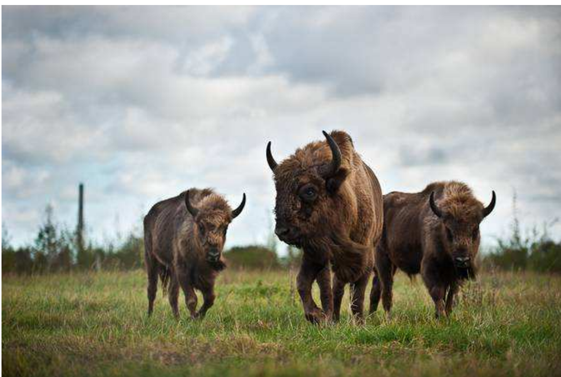
Figure 8. European bison on the meadows on the southside of River Guden (RR, 2014b)