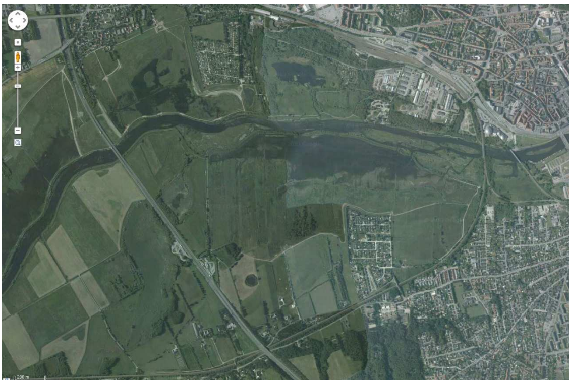
Figure 7. Overview of the reestablished wet meadows of Vorup in 2013 (GoogleMaps, 2014)