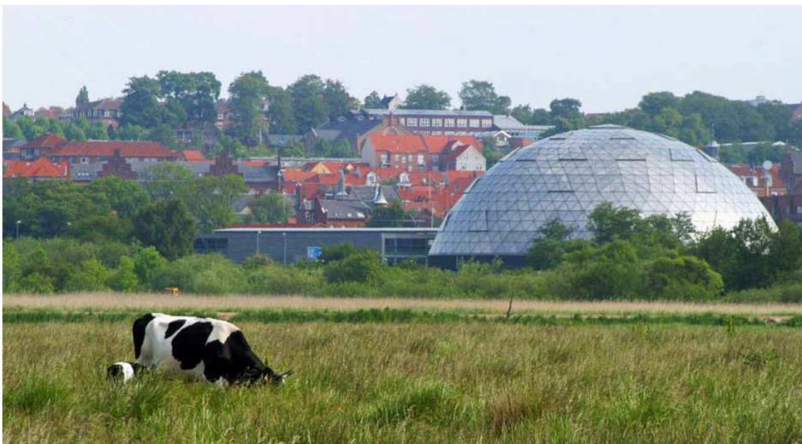
Figure 6. Ancient Danish dairy cow breed grazing on Vorup Meadows (RR, 2014b)