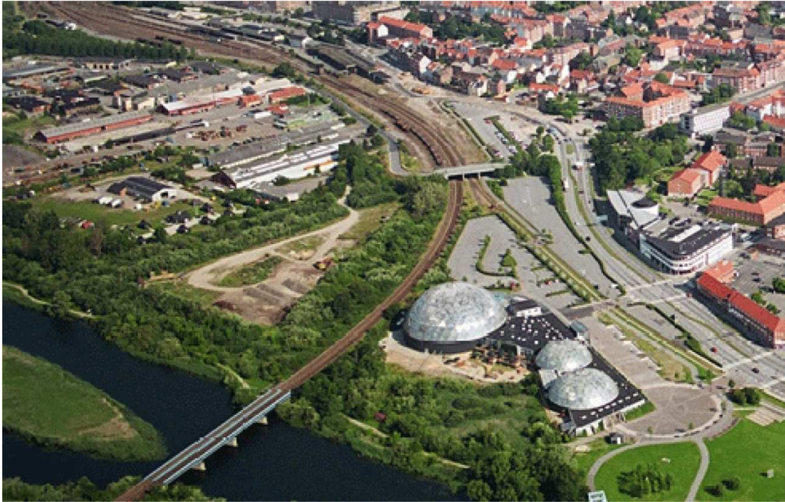
Figure 3. Randers Tropical Zoo – overview (RR, 2014b)