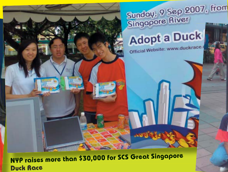
NYP raises more than $30,000 for SCS Great Singapore Duck Race

companies, and urge individuals to be a part of this charity by adopting the ducks."