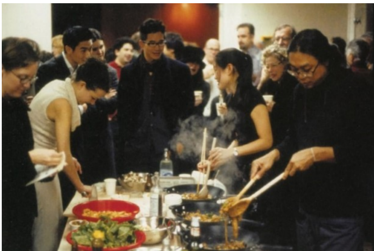
Figure 3. Rirkrit Tiravanija, Untitled (Pad See Ew) (1990/2002) at SFMOMA