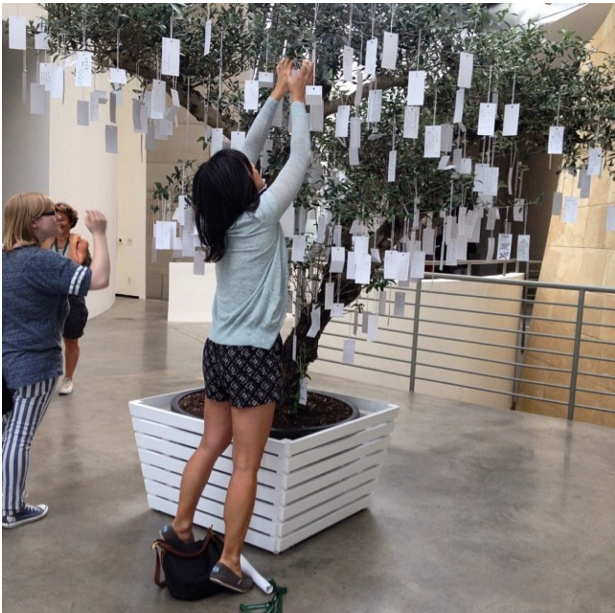
Figure 1. Yoko Ono, Wish Tree (1996/2004) at the Guggenheim Bilbao

Distributed creativity in online environments can take place everywhere and at any time as compared to special times and places for creativity. The “where” is particularly important in crowdsourced art because, before the advent of the Internet, public participation in art projects most often occurred within the physical context of the museum or gallery (with the important exception of site-specific art). Looking at the history of participatory art, the most groundbreaking and renowned of such projects - like Rirkit Tiravanija’s culinary experiments or Marina Abramovic’s The Artist Is Present - all took place within the confines of these institutional structures. Even Yoko Ono’s Wish Tree , which invites participants to write down their desires and hang them onto the branches of a live tree, is separated from the natural environment and brought inside the museum.