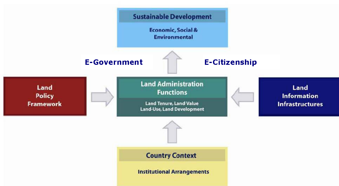
The Land Management Paradigm (Enemark et al., 2005).

The organisational structures for land management differ widely between countries and regions throughout the world, and reflect local cultural and judicial settings. The institutional arrangements may change over time to better support the implementation of land policies and good governance. Within this country context, the land management activities may be described by the three components: Land Policies, Land Information Infrastructures, and Land Administration Functions in support of Sustainable Development. This Land Management Paradigm is presented in the figure below: