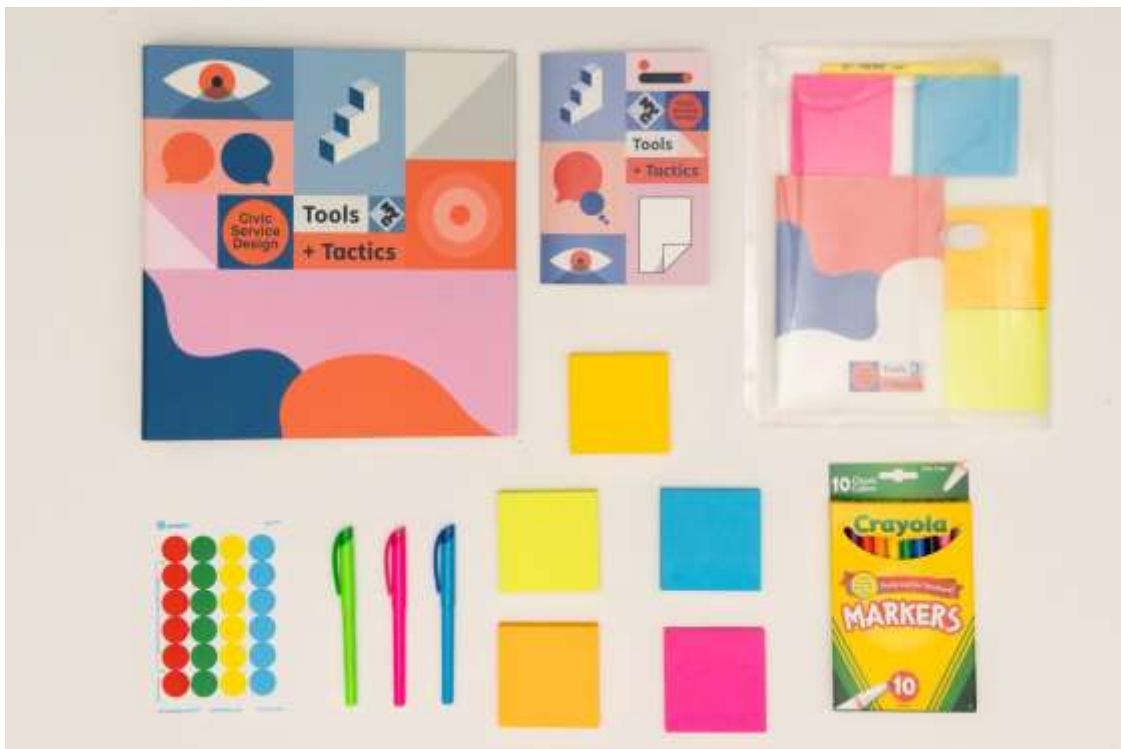
Figure 4. Tools + Tactics and supplies provided by Civic Service Design Studio to NYC government staff.