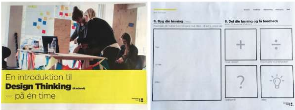
Figure 3. (Top) First day of Master class at Innovationshuset, 30th of January 2018 (Down left) Design thinking introduction in 1h (Down right) Design thinking introduction template page 8, 30th of January 2018