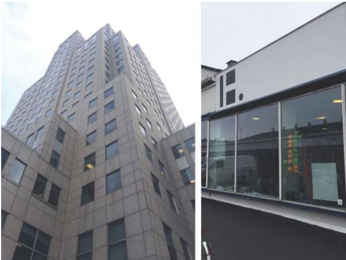
Figure 2 (Left) Building in which Civic Service Design Studio is located – 18th floor, February 2019 (Right) Innovationshuset facility, March 2018