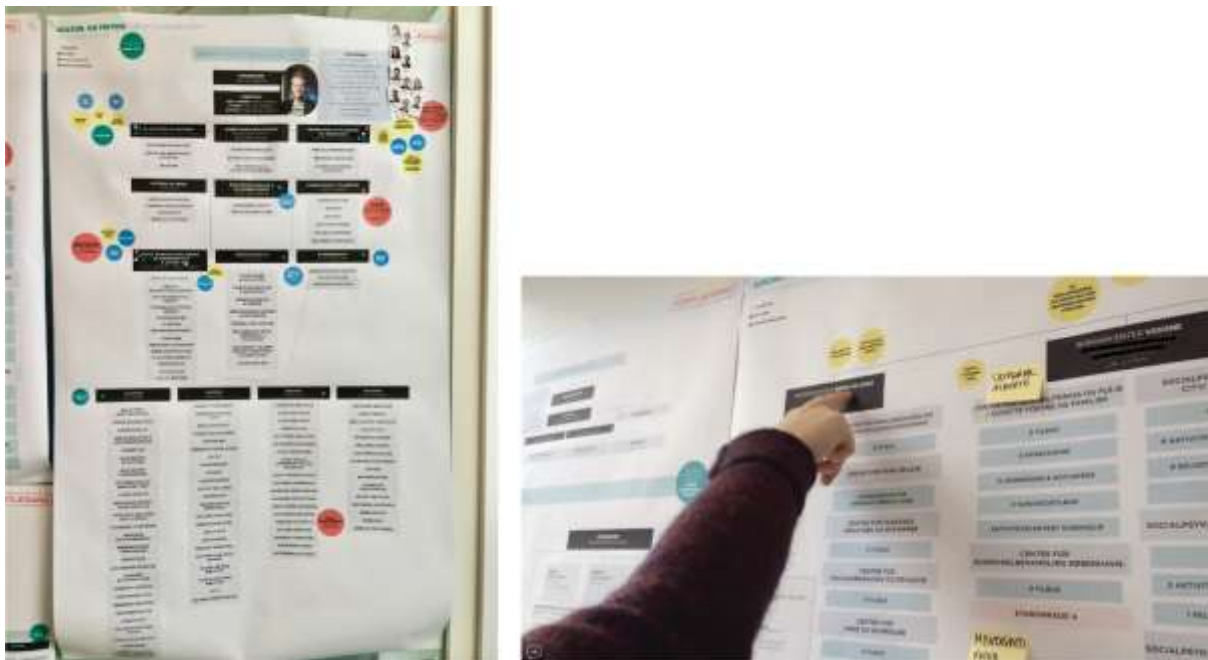
Figure 5 (Left) Organisation chart posters of Copenhagen Municipality (Right) Junior service designer pointing at a key layer for collaboration across administrations (right), 27th of March 2018

Copenhagen municipality is complex. As the co-chief of innovation of Innovationshuset said: “So many different strategies, very big municipality, then very different departments, very different arenas whether you’re working with youth, schools, whether you’re working with elder care, it feels like not the same organisation.” Therefore, to cope with this complexity, Innovationshuset’s team used organisation charts as compass and navigation maps for facilitating their work with the administrations. The organisation charts of the seven administrations were graphically designed, printed on large posters and put on the walls in the meeting/team rooms as shown on figure 5. The posters were annotated and helpful as one junior service designer said: “It’s nice to see which people you need to get in touch with when you are in different projects.”