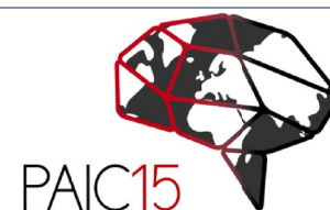
FIGURE 3 The PAIC15 scale