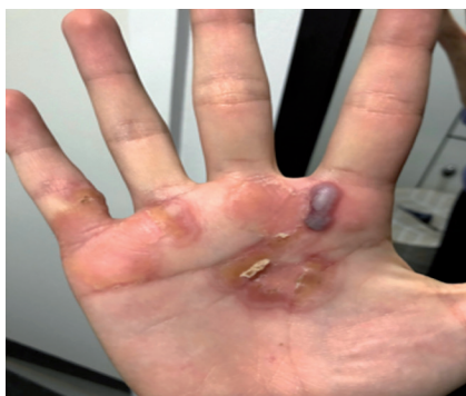
Fig. 1. Right hand, 6 th of April.

started until the 3 rd of April. Almost at the same time as the dry cough the boy developed skin lesions. The skin lesions were mildly pruritic symmetric erythematous papules developing to vesicles located on the hands. On the 13 th of April the pulmonary symptoms worsened and he was admitted to the paediatric department. The tentative diagnosis was asthma exacerbation. The chest X-ray was normal, and the throat swab and tracheal aspirate for COVID-19 was negative. The tracheal secretion culture was negative for bacteria causing atypical pneumonia (mycoplasma, legionella, chlamydia) but positive for Moraxella catarrhalis , and he was treated with amoxicillin/clavulanic acid in tablet form for a 10 day period. The blood test showed only mildly neutrophilia 7.8 mmol/l, and a normal C-reactive-protein (CRP). A lung function test revealed a drop in FEV-1 to 45% of what was expected (FEV-1 76% of what was expected in November 2019). Because of the severe pulmonary symptoms, he was treated with 50 mg prednisolone daily for one week. After a week of hospitalization, he was discharged with increased doses of asthma medication.