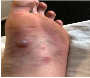
Fig. 3. Left foot, 5 th of June.