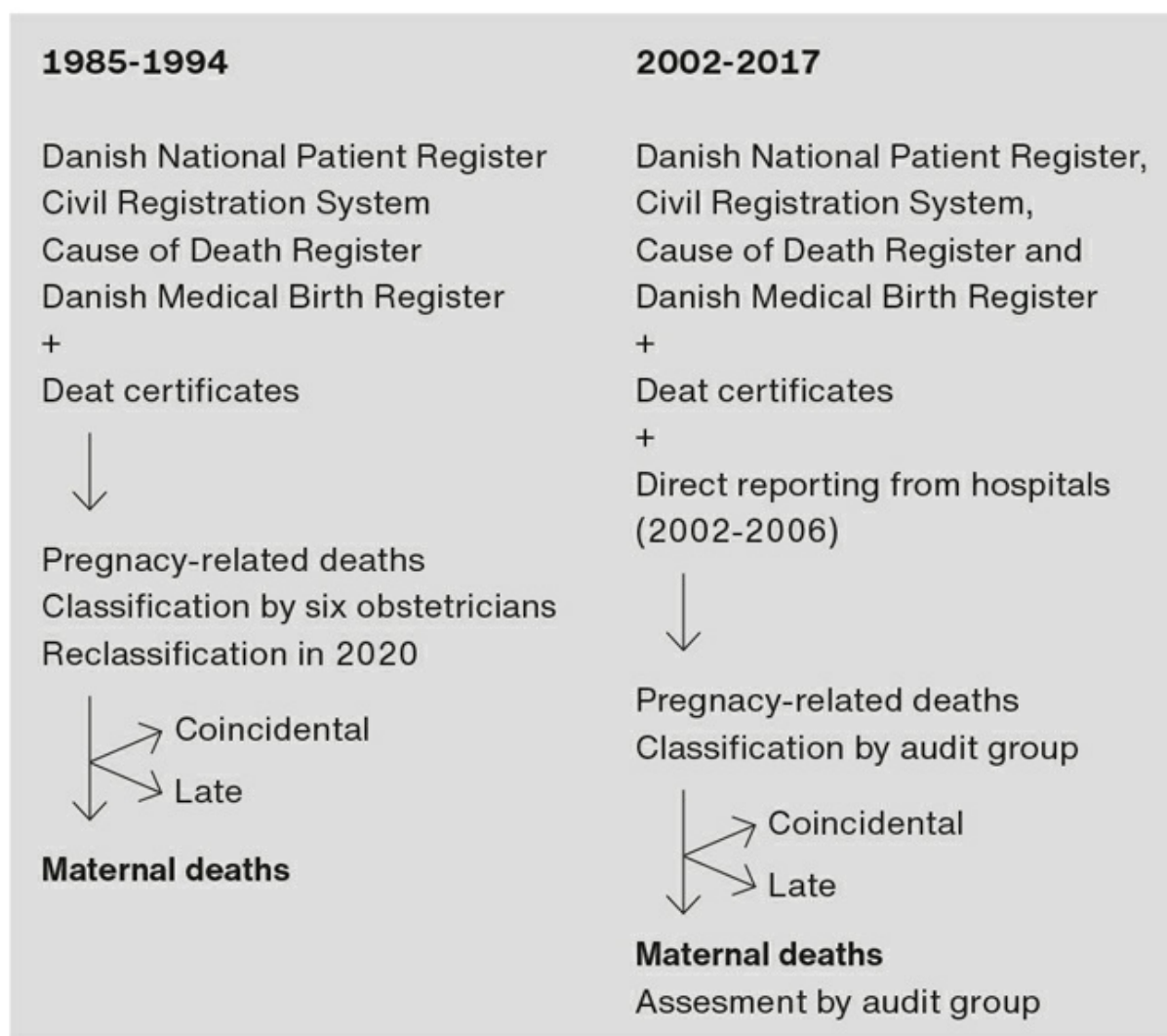
FIGURE 1 Methods and databases used to obtain data on maternal deaths for 1985-1994 and for 2002-2017.

We identified deaths by linking four Danish national registers: the Danish National Patient Register, the Civil Registration System, the Cause of Death Register and the Danish Medical Birth Register. In both periods, register data were combined with data from death certificates. For 2002-2007, this was compared with direct reporting from hospitals. All women who died and had an ICD-10 code in the DO00-DO99 or DZ32-DZ399 range were identified, and primary and secondary ICD-10 codes and causes of death were then extracted from the Danish National Patient Register and the Cause of Death Register. If, based on register data or direct reports, a death was suspected to be maternal and occurred within 42 days after a pregnancy (in accordance with the international definition) we requested full medical records from hospitals and from family doctors, if needed.