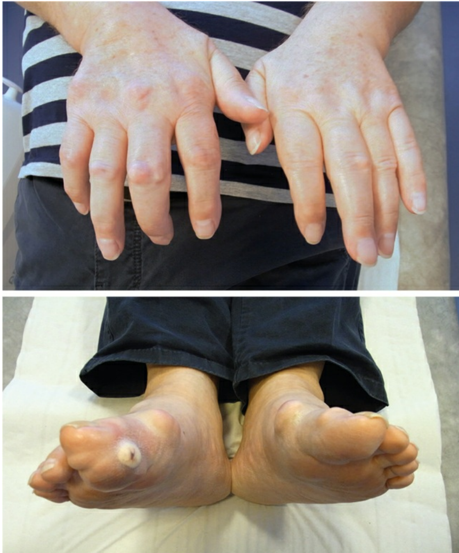
A 60-year-old male with abundant urate deposits (tophi) after 20 years with undiagnosed gout and no urate-lowering therapy.

Previous studies have described treatment of patients with gout in either specialised rheumatology care or in primary care [11, 12]. We aimed to investigate whether patients with definite gout received the recommended treatment in real-life mixed settings (rheumatology clinics, emergency wards, other specialties and in general practice), and if not, to describe the factors associated with failure to reach the target serum urate concentration.