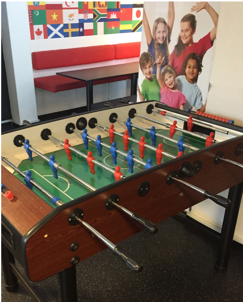
Fig. 2. Yasin enjoys playing table football with his friends in the cafeteria at the same time every day.