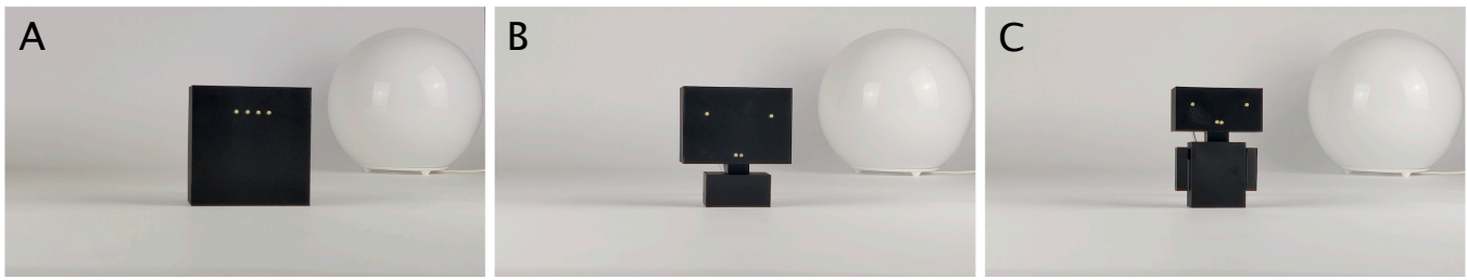
Figure 2: The three versions of FiPA with increasing degree of anthropomorphism (left to right). All aspects, apart from the physical embodiment, such as height, material, lighting, and the framing were kept consistent. Prototype A was 11x11cm (w x h), Prototype B was 10x11cm, and Prototype C was 8x11cm.

prototype was Prototype C ( M = 7.73 , SD = 1.4 ), followed by Prototype B ( M = 5.54 , SD = 1.5 ), and Prototype A ( M = 1.38 , SD = .64 ), see Figure 2. Post-hoc comparison with Bonferroni corrections furthermore revealed that all pair differences here were significant at a p < .01 level. We also investigated whether the participant variables of gender, age, or previous experience with PAs influenced these results. A mixed model repeated measures ANOVA with demographic variables as between-subjects factors showed no significant interaction effect of gender or previous experience with PAs and anthropomorphic assessment of the prototypes. However, we found a significant interaction effect of age and anthropomorphic assessment ( F(2,48) = 3.67 , p = .03 , \eta^2 = .13 ). A post-hoc comparison did not reveal any significant differences between pairs of prototypes.