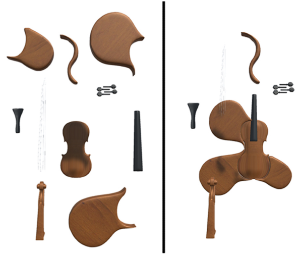
Figure 4. A screenshot from the application where the participants explore a puzzle with the components of the Violino Arpa.

The items of the questionnaire were divided into three categories: Online version, Mobile version, and a comparison between the two. The specific terminology was used (Online/Mobile) to describe the two versions of the app, in order to be more understandable and less confusing for the participants. These three sections have the same 9 questions concerning the functionality, efficiency, interactivity, and usability of the application.