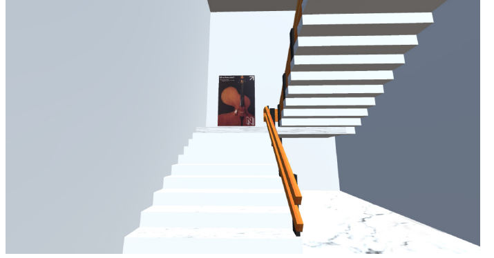
Figure 2. The view when one enters the desktop application, which is an imitation of the staircase of the Danish Music Museum.

The Violino Arpa is unique instrument that is fortunately preserved at the Danish Music Museum in a good condition. However, due to its age combined with this desire for preservation the instrument cannot be played by