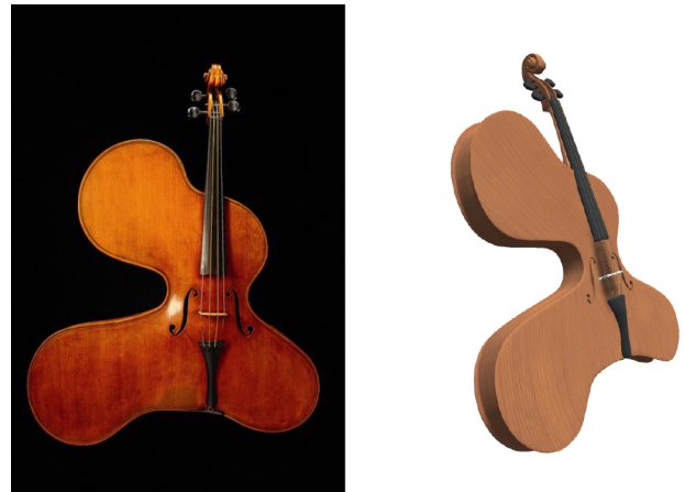
Figure 1. A photograph of the Violino Arpa or Amoeba violin owned by the Danish Music Museum and a 3D visualization of it.

Copyright: © 2021 the Authors. This is an open-access article distributed under the terms of the Creative Commons Attribution 4.0 International License , which permits unrestricted use, distribution, and reproduction in any medium, provided the original author and source are credited.