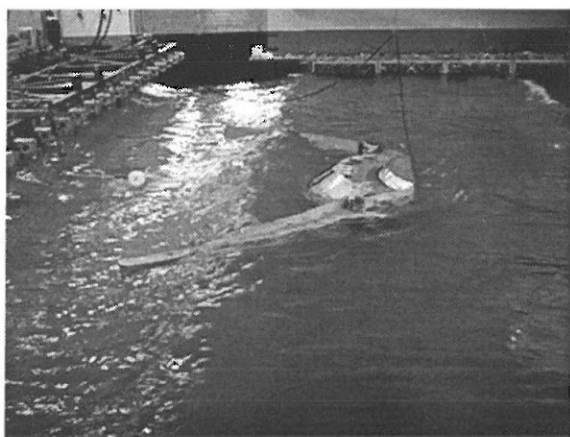
Figure 1: Photo of the Wave Dragon.

Over the recent years wave energy converters (WECs) have gradually been brought into focus utilizing various concepts of energy conversion from the waves. One special class of WECs is the overtopping type, i.e. it converts the potential energy obtained when waves are overtopping into a reservoir at a higher level than MWL by leading the water back into the sea through a number of turbines. Among such WECs is the Wave Dragon (WD), developed and patented by Friis-Madsen. The WD has been under continuous development since 1995 supported by the European Union (EU) through the JOULE-CRAFT programme and the Danish Wave Energy programme. Present development plan (2001-2002) includes the deployment of a 1:4.5 scale model WD in a large inlet in Denmark where the wave climate resembles the downscaled North Sea wave climate.