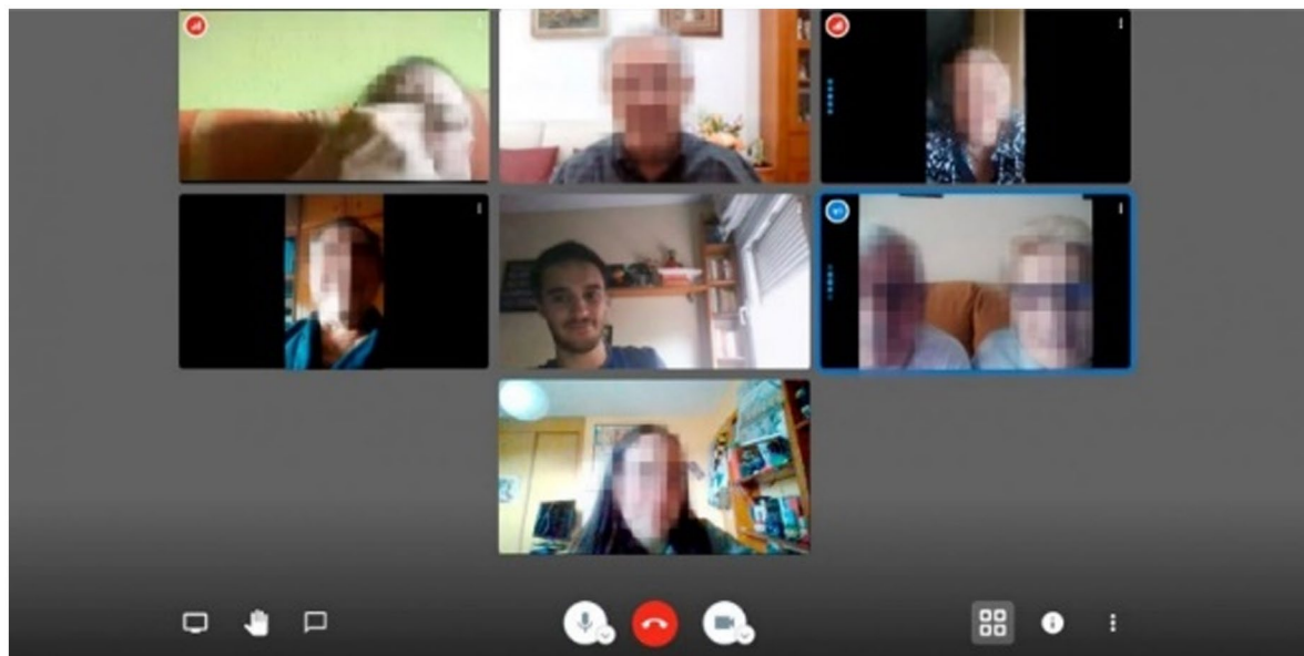
FIGURE 1 | One of the talks on Jitsi with advanced students of information and communication technology (ICT).

Jitsi posed barriers for a few students. The ethnographer shared the call’s link on WhatsApp, and since many did not