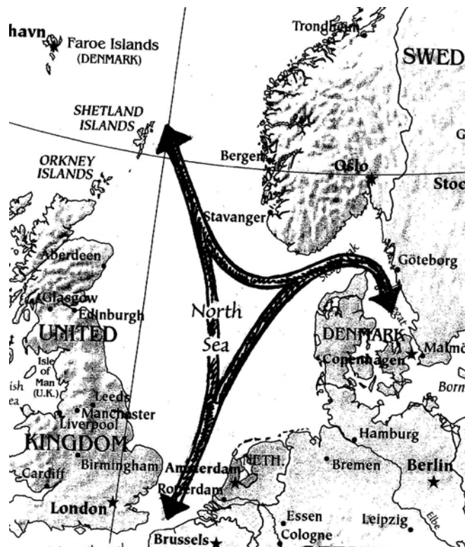
Figure 3: Principal routing of the North Sea Motorway

One of the aspects to be dealt with by the SUTRANET project is the development of the North Sea Motorway (NSM) concept. The principal routing of the NSM is illustrated in Figure 3.