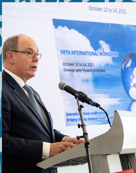
Photo HSH Albert II Prince of Monaco.

On October 2021, 37 experts from 15 countries participated in the Fifth International Workshop on the Economic Impacts of Ocean Acidification held in Monaco. The participants focused on using marine biological processes to fight climate change.