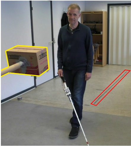
Figure 2: Picture of the setup: red - trail created from folded tape. yellow - the boxes used as obstacles