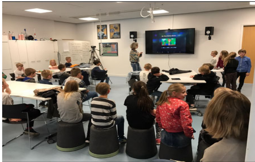
Fig. 4. One of the groups presenting/demonstrating their stop-motion film and pitching their digital game-design idea in front of the class.