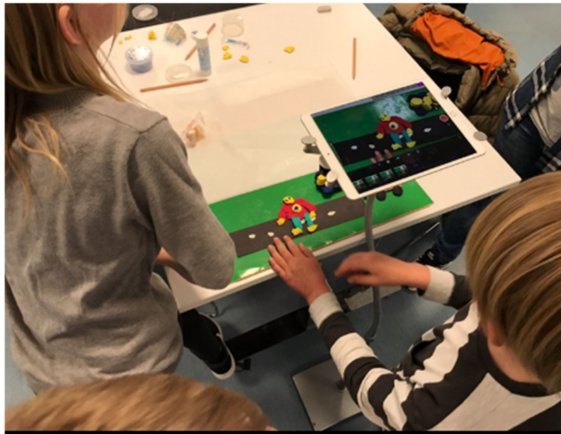
Fig. 3. One of the groups working on the production of their stop-motion film.