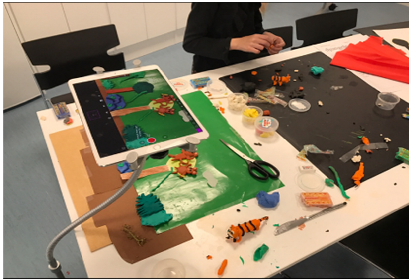
Fig. 2. Overview of one of the groups' workstations. In the midst they are creating props for their stop motion film (with the iPad in the foreground).