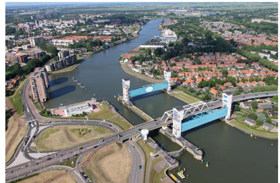
Figure 3: The Algra complex consisting of a lock, a bridge, and two storm surge barriers.

A supervisor should continue to operate, with degraded service, when a fault occurs, such as a broken wire, defect sensor, or blocking actuator. One option is to activate another supervisor, designed specifically for the type of fault that occurred [11]. Alternatively, the plant components and requirements can be divided into fault-free and post-fault behavior, depending on the type of fault. The latter approach was used in [12] to synthesize a fault-tolerant supervisor for the Algra bascule bridge over the river IJssel, depicted in Figure 3 , with two vehicle roadways as well as lanes for cyclists and pedestrians.