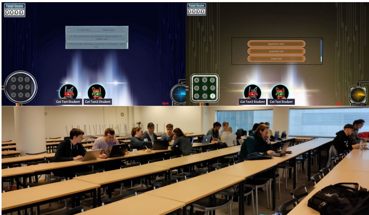
Figure 3: Dashboard and classroom configuration for Game 1

The first course involved undergraduate students in Aalborg University, Denmark, enrolled in the Medialogy curriculum, during a course entitled “programming of complex software systems”. Since the course was delivered in a hybrid format due to partial resuming of classes after the Covid lockdown, only a group of 12 students took part in the game sessions. Game 1 was a multiplayer digital quiz like the one found in the popular educational application Quizlet: students are paired randomly, one student gets a series of questions while the other gets a set of responses, and they need to work together to pair the correct question and answer. Figure 3 presents a screen capture from the players’ dashboards in this game, and a picture of the students sitting in playing pairs in the classroom. The students moved to sit in pairs or in small groups formed of several player teams. However, the classroom configuration did not allow for much flexibility.