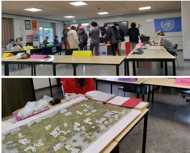
Figure 4: Board game and classroom configuration for Game 2. Some students regroup around the boardgame table while others are busy at their learning tasks.

(worksheets, group discussions), they earn resources that can be spend for the progression of their nation on the game board. Figure 4 presents the boardgame and students during a play session.