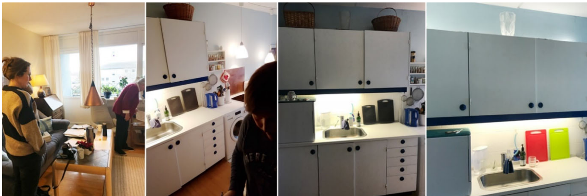
Figure 2. Visuals from one of the homes visited. The photos show: 1) the researcher observing the interaction of the consultant and participant in the lighting assessment, 2) the consultant measuring light and documenting the scenarios, 3) the existing scenario, and 4) the scenario after the recommendations have been implemented.

Lighting changes typically involved rearranging existing luminaires and settings or purchasing and installing new, recommended luminaires. As seen in Figure 2, this could be changing and repositioning the light under the cabinets to support activities on the kitchen, such as preparing food or managing the dishes. Or adding indirect lighting by illuminating the wall and ceiling above the cabinets, to optimize the general lighting.