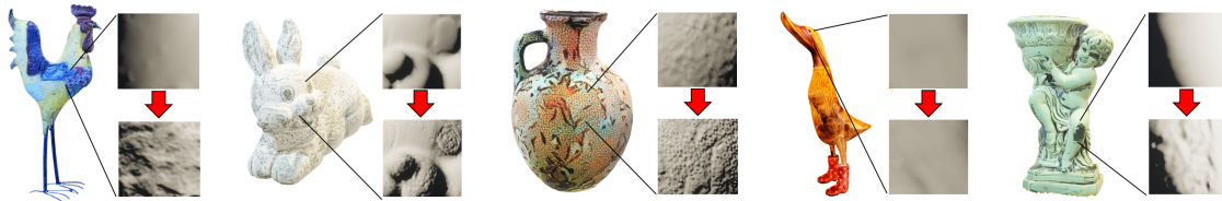
Figure 1: Results from the proposed 3D asset variation creation pipeline, using a combination of an albedo transformed from a style transfer network and generated texture maps

1 Computer Graphics Group, Department of Architecture, Design and Media Technology, Aalborg University, Denmark