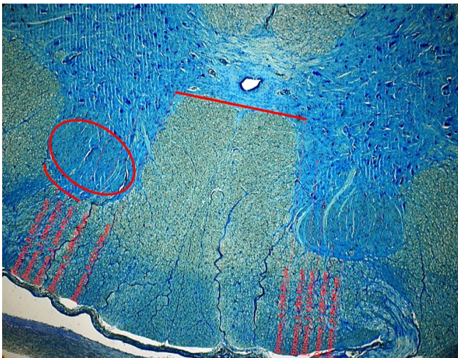
Fig. 3 The dorsal and ventral horn and substantia gelatinosa were clearly distinguishable on Nissl-stained sections. This section is at the C7 level, where the ventral horn is relatively large compared to the dorsal horn.

The depth of the dorsal boundary of the dorsal horn, the substantia gelatinosa (lamina II), lamina III-VI and the ventral horn increased with more rostral sections (Table II). The