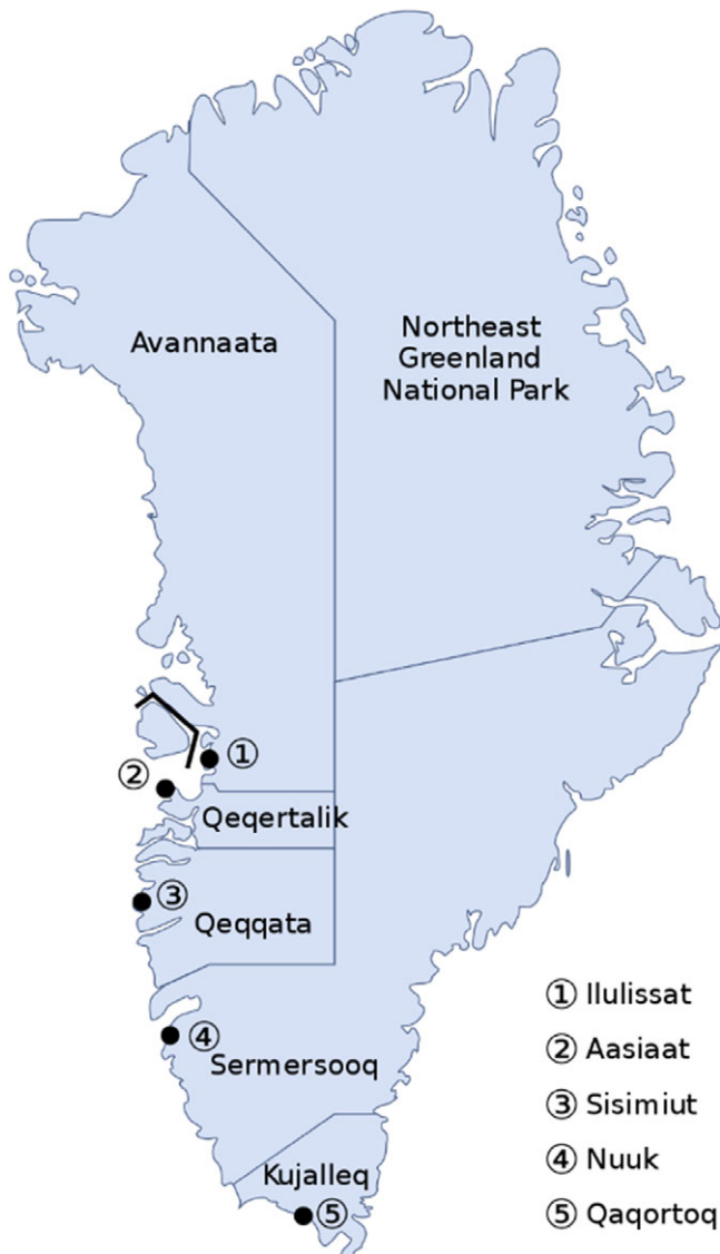
Fig. 1. Administrative divisions of Greenland since 2018/01/01, with municipal centres marked with numbers (Anon, 2018).

inquired into capacity constraints related to tourism management and sustainable development and needs for coordination, planning and governance related to tourism. We also discussed expectations about the future of tourism demand and tourism development patterns in Greenland and the stakeholder's knowledge about and views of Iceland's tourism experience and responses to growth. Lastly, points of comparison and the desirability of transferring knowledge between Greenland and Iceland were inquired.