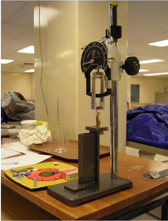
Figure 1: Stretch device with cadaver muscle in situ