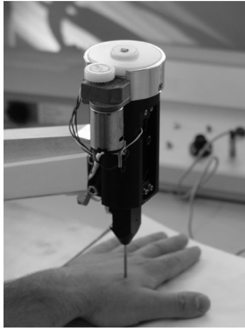
Figure 3: Photograph of automated viscoelastometer