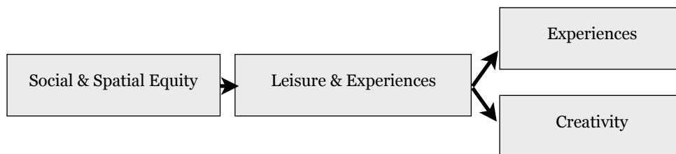
Figure 6.4: Shifts in the Focus of Development of the Municipality Story-Line.

The third story-line which I have interpreted over the last 30 years is related to the focus of the municipal plan and municipal development generally. This story-line is initially related to questions of spatial and social equality, in the way in which land use and physical planning can provide equality of access to services and equal standards of housing to various groups.