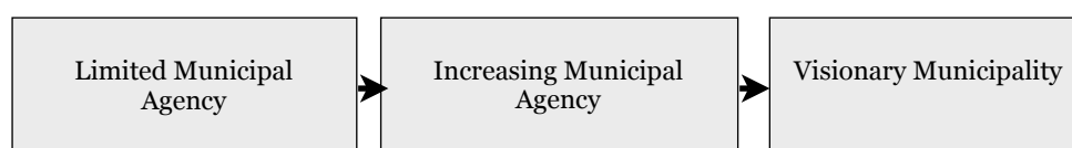
Figure 6.2 - Shifts in the Role of Municipality Story-Line.

In this story-line I have interpreted a shift in the municipality’s perception of their role through municipal planning. This is significant in terms of a change in the agency which the municipality imagines for itself. This moves from a fairly limited role in development in the 1980s to a much wider view in the 1990s. This story-line is also linked to the other two which I interpret in this analysis, where I demonstrate the increasing ‘range’ of vision and focuses of development of the