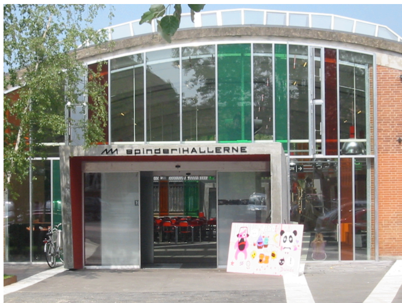
Figure 7.2: 'The Spinning Mill Halls' [ Spinderihallerne ].