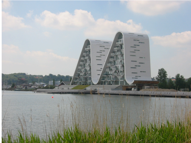
Figure 7.1: 'The Wave' [ Bølgen ].