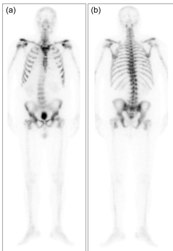
FIGURE 2 A 69-year-old man with high-risk prostate cancer and no bone metastases at primary staging was treated with peripheral androgen blockade. Shortly after, the patient was diagnosed with noninvasive urothelial tumour with high malignancy from a bladder polyp. One year later a bone scintigraphy in anterior view (a) and posterior view (b) revealed widespread skeletal metastasis—superscan, which can be easily misinterpreted as normal scanning. Biopsy from the iliac bone revealed metastases from the urothelial carcinoma.

et al., 1998; Kotb et al., 2007). One prospective study examined the presence of metabolic superscans in association with hypermetabolic status in various groups of hyperthyroidisms and found an incidence of metabolic superscans of 90% in patients with Graves' disease (27 patients out of 30), whereas the incidence of superscans was only 2 out of 10 patients (20%) in toxic nodular goitre patients. Superscans were not encountered among the 5 patients with autonomous toxic adenoma (0/5, 0%) (Kotb et al., 2007). In addition, a reasonable correlation was found between thyroid uptake on thyroid scintigraphy and superscan features in Graves' patients, but no correlation was shown between thyroid stimulating hormone, thyroxine and tri-iodothyronine levels and superscan features (Kotb et al., 2007).