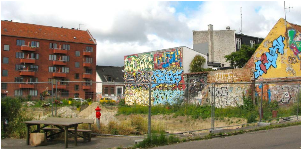
Figure 6. Site of the former auto repair plot used as a park until March 2015. It is now being prepared for construction of youth housing.

"I think public involvement is very important, and at the same time, I'm perfectly aware that nobody shows up at hearings and residents' meetings and so on, until the day construction is started, and then suddenly everyone complains, like, 'why were we not involved in this?!' And I'm pretty sure that it's because, for instance, hearings seem so boring, like, 'who on earth would want to attend that?'" But the authorities can say 'well, we did invite you, but nobody showed up, so...' So we need a different form of public involvement" R43, female, 30-40, lives in SocialHousing+.