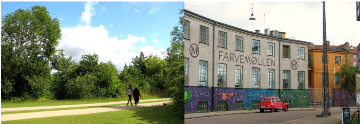
Figure 5. Left: The recreational area Utterslev Mose. Right: Former paint factory in Nordvest now housing studios for media firms.

cultural activities generally have higher educational backgrounds, are in stable employment or studying and have rather large social networks which, despite these interviewees' great appreciation for urban diversity, are quite homogenous. This illustrates the point made by Blokland & van Eijk (2010) of how positive attitudes towards diversity do not necessarily translate into practising diversity. Especially to the youngest of these interviewees, below approximately 40 years of age, living in a big city and enjoying urban life are key elements in their rather creative and cultural lifestyles. They like the vibrant urban environment in particular the Nordvest neighbourhood and make use of its cultural activities like bars and galleries, but other parts of Copenhagen are highly important to them as well. Amongst the older interviewees, cultural consumption is more traditional, e.g. attending classical concerts or visiting museums. While they appreciate the diversity of their neighbourhood, their cultural activities generally take place in the Copenhagen city centre. Bispebjerg, on the other hand, is used for daily shopping, visiting the new library (see Figure 9, Appendices for photograph, sporting or taking a stroll at Utterslev Mose.