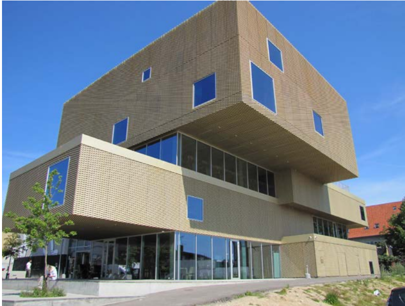
Figure 9. The new public library and cultural centre in Bispebjerg.