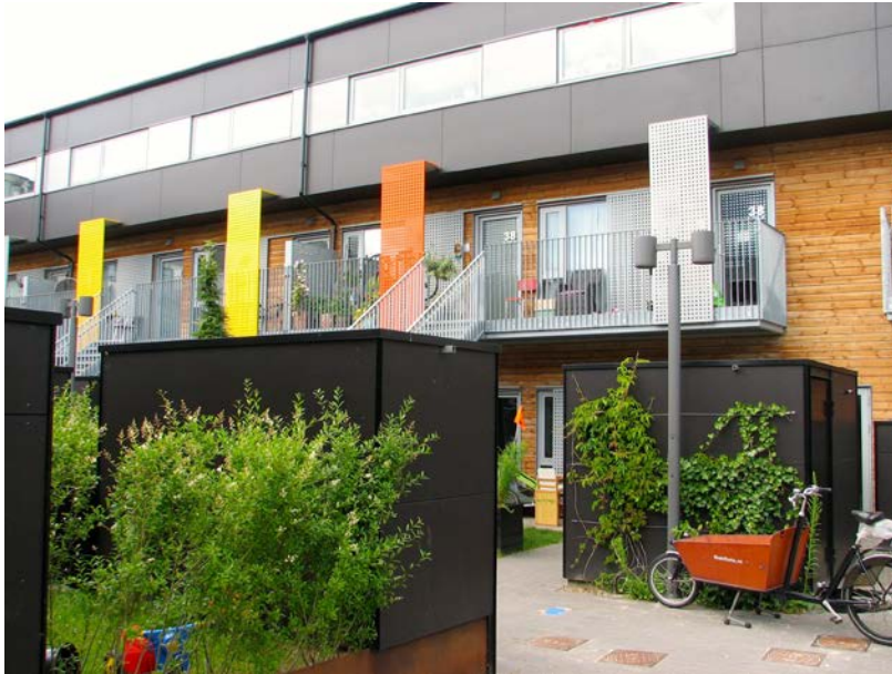
Figure 7. The SocialHousing+ estate in Bispebjerg.