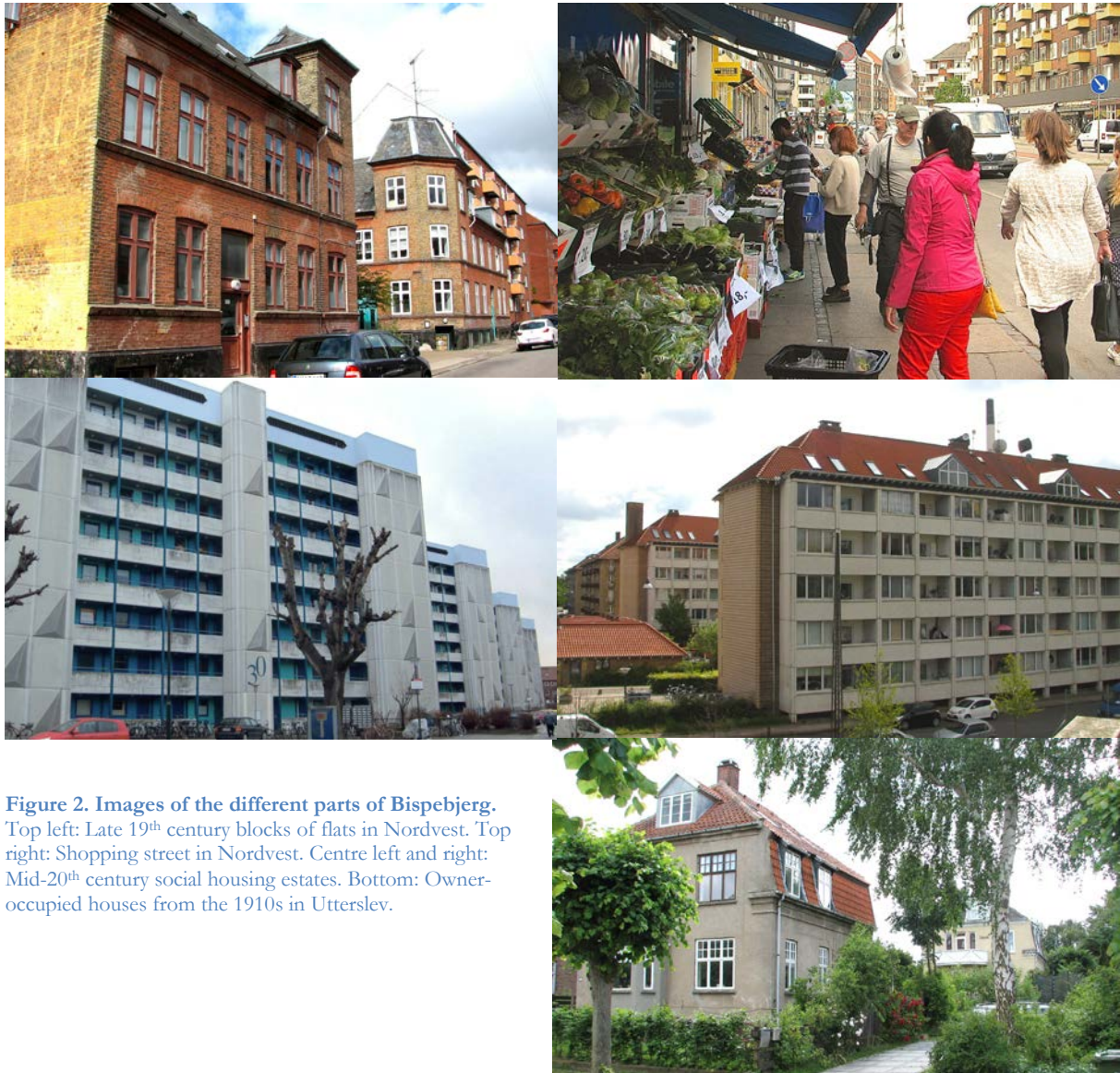
Figure 2. Images of the different parts of Bispebjerg. Top left: Late 19 th century blocks of flats in Nordvest. Top right: Shopping street in Nordvest. Centre left and right: Mid-20 th century social housing estates. Bottom: Owner-occupied houses from the 1910s in Utterslev.

the beginning of the 20 th century. Some social housing blocks can, however, be found here as well. The two neighbourhoods are divided by a large recreational area consisting of the scenic Bispebjerg Churchyard and the park-like Utterslev Mose. The municipal boundary runs north of Bispebjerg, and from here, it is approximately seven kilometres to the Copenhagen city centre.