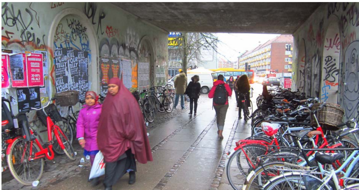
Figure 4. Street scene, Nordvest neighbourhood.

“It’s just that when you meet them in groups... I don’t have anything to pin it on. It’s just that I think they have ruined our neighbourhood. That’s what irritates me. It’s not the individuals, you know” R28, female, 77, retired secretary, ethnic Danish background, has lived in Emdrup for several decades.