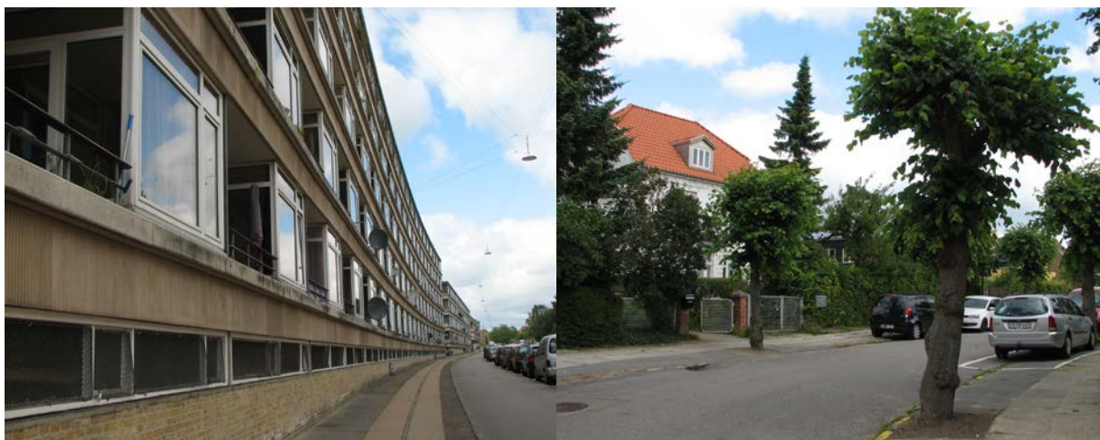
Figure 3. Left: Social housing estate in the hillside neighbourhood. Right: Detached housing area in Utterslev.