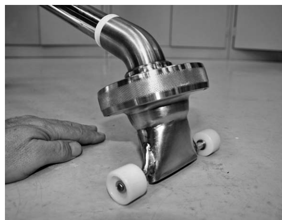
Fig. 2 A specially made filter cassette was mounted on a traditional vacuum cleaner (1600 W) for dust sampling. Small wheels were mounted on the opening to maintain a distance of 5 mm between the vacuum cleaner head and the sampling surface.

These high levels of ΣDDT raise concern. When considering oral exposure, the acute oral minimum risk level (MRL) for DDTs in humans is 0.5 μg -1 kg -1 day -1 . 26 Toddlers and younger children have vulnerabilities to chemicals that are distinct from adults. Their exposure is expected to be higher because of their activities on the floor and their tendency for ingestion of non-food items and hand-to-mouth behaviour. 30 The ingestion “central tendency” value of indoor dust in toddlers aged 1 to 3 years is 60 mg per day. 31 If we consider