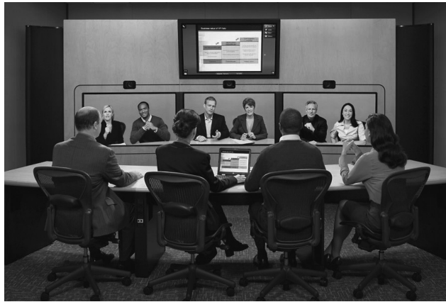
Fig. 1. HP Halo.

to the appropriate expertise required wherever it is located. The issue here is not simply about enabling a distributed set of individuals to work together which arguably are supported by a range of conventional desktop collaboration products such as video chat, NetMeeting, Google Docs, and so forth. Rather the concern is also about how to enable multiple collocated teams situated at different locations to work more effectively together when collaborating across a distance.