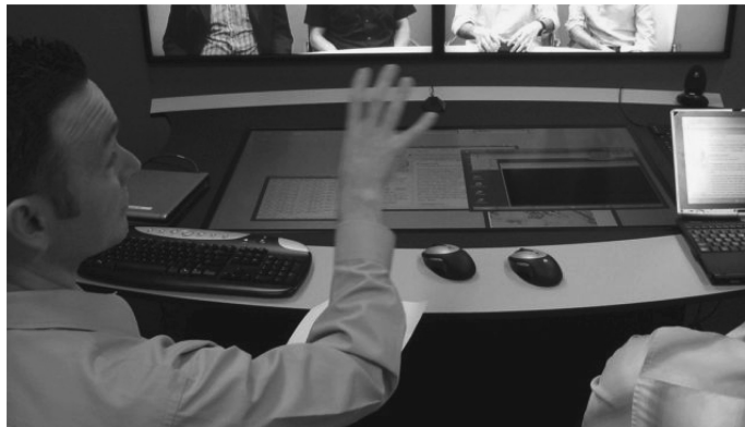
Fig. 5. Table rim in BISi designed to accommodate keyboards, pointing devices, as well as laptops that people might need to bring into the collaboration without interfering with the horizontal touch surface.