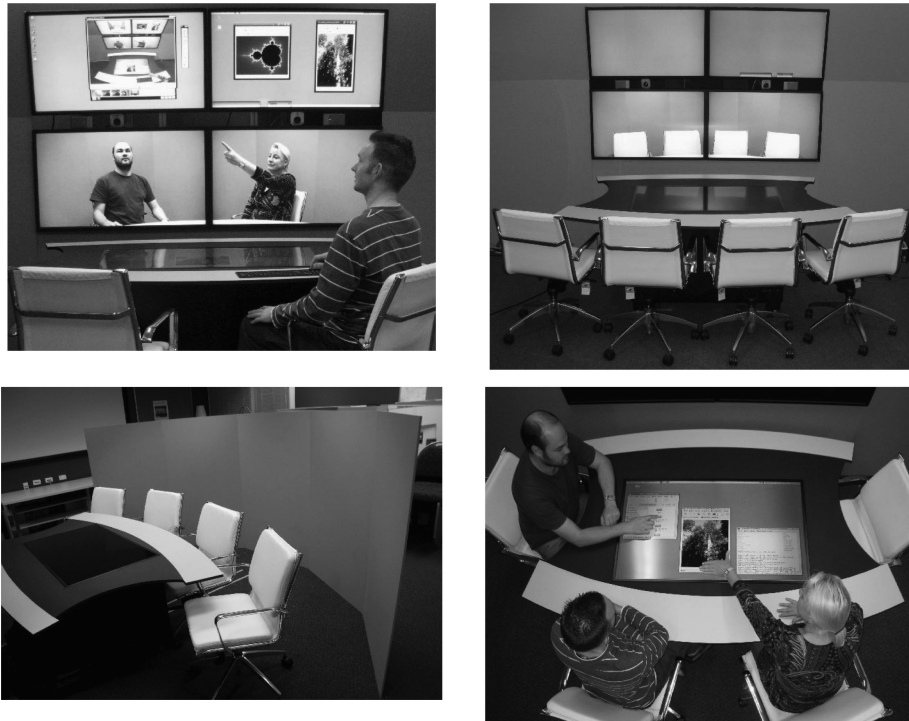
Fig. 2. The BISi set-up.

in spite of its interactional affordances if it is cumbersome to get information and applications to and from the system.