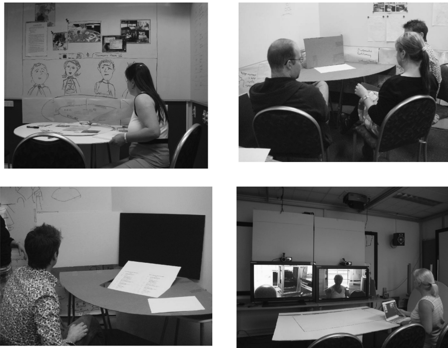
Fig. 4. Iterations of full-scale mockups of Blended Interaction Spaces.