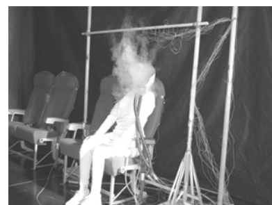
Figure 2. Effectiveness and experiment with smoke visualization for the neck supporter.