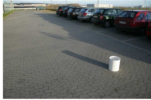
(a) Input image

Figure 3 visually illustrates the illumination estimation for a given scene. Notice how the color of the Sky dome corresponds to the actual Sky color in the image, although this information has not taken part at all. The only information used is the overlay color resulting from finding the intensity ratio between a region in direct light and a region in shadow.