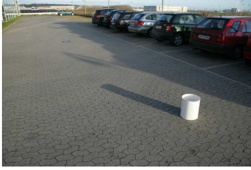
(a) Input image