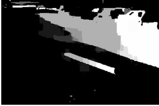
(b) Detected shadow levels