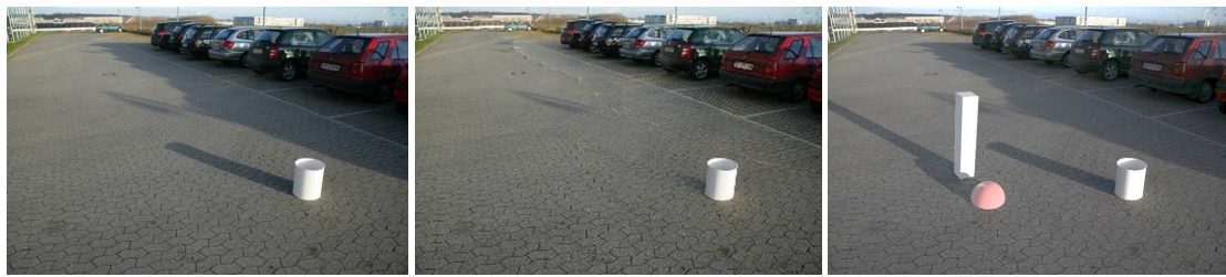
Figure 1: Illustration of idea in this work with images. Left: input image acquired outside in sunshine. Center: real shadows automatically detected and removed to illustrate performance of detection. Right: information from shadow detection step has been used to estimate Sun and Sky illumination conditions and virtual objects have been rendered into the scene with credible shading and shadowing.

reasonable, since cameras in the near future will include GPS information into the image header, as well as date and time. The second assumption is reasonable, since there is a lot of outdoor world to photograph. The third assumption is also reasonable since urban scenes have a lot of road, pavement, brick, and concrete surfaces, which all are approximately Lambertian. Moreover, we conjecture that the diffuse surface assumption can be relaxed greatly in the future due to further research.