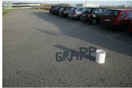
Figure 5: Shadow manually drawn into image. The pixel values inside the artificial shadow is automatically determined. Using this approach we intend to solve the shadow protection problem in order to avoid double shadows.

It would also be interesting to measure the performance of the technique presented in this paper against light probe images to establish the degree of absolute accuracy.