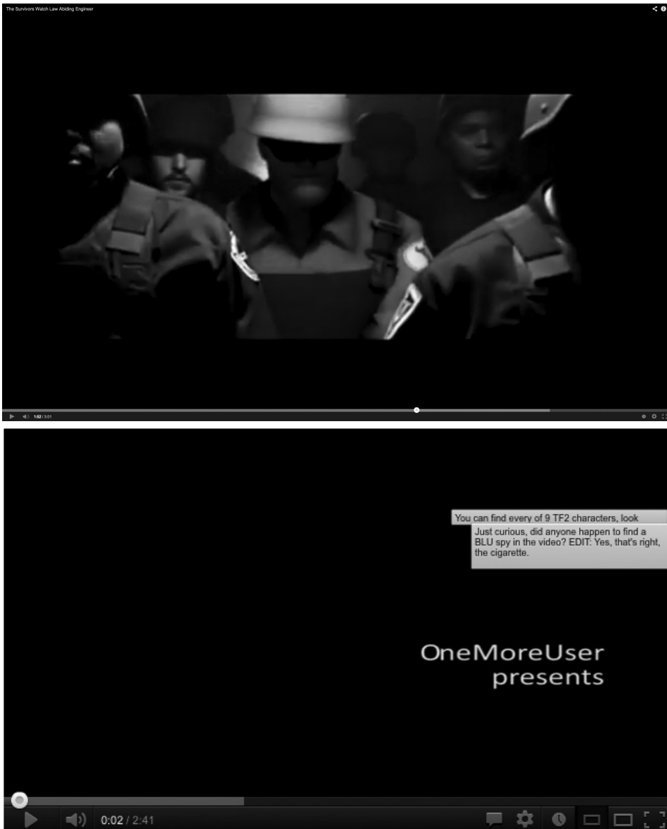
Figure 3 & 4. Team Fortress 2 – Law Abiding Engineer

when originally uploaded, did not call for community participation, but rather for skilful acknowledgement, as TrueOneMoreUser underlines by placing himself in the intro-credits as director and by declaring in the text below the video: “I proudly present my biggest animating/compositing project I ever did.” The majority of comments are also accolades to the creator’s visual and editing skills rather than comments related to the universe of the game or the everyday reflections. But TrueOneMoreUser has subsequently added text signs that address the YouTube community regarding the computer game characters encouraging them to socialize throughout, as can be seen in Figure 4, e.g.: “just curious, did anyone happen to find a BLU spy in the video?”. By adding these