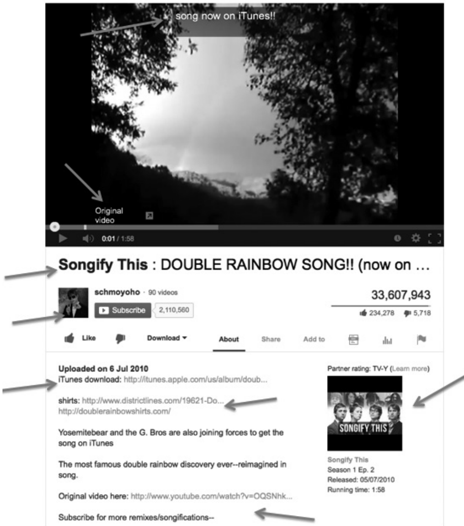
Figure 2. The Screen of Double Rainbow Song