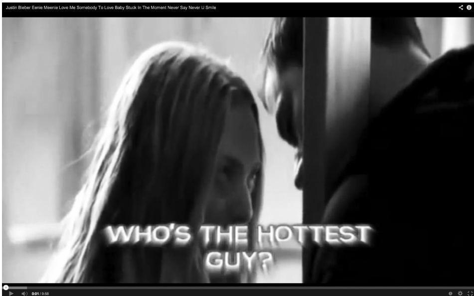
Figure 5. Justin Bieber Pray Music Video Eenie Meenie Love Me...

Justin Bieber Pray music video Eenie Meenie Love Me (...) is a musical collage that reflects on popular culture. It calls for social interaction by adding a text in the beginning