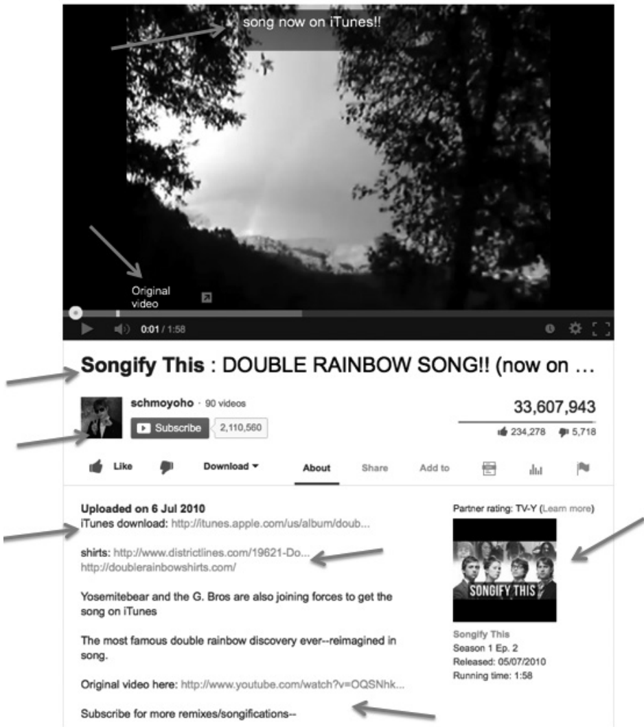
Figure 2. The Screen of Double Rainbow Song