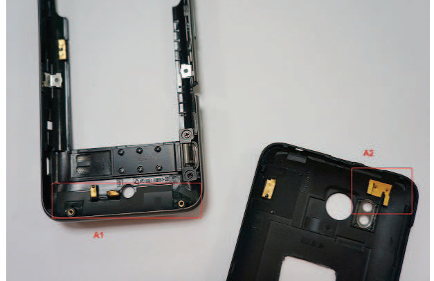
Fig. 1. MIMO Set-up on Thunderbolt.

Recently the first phone on the market able to cover LTE-700 bands and announcing good performances with MIMO was released [3]. In this paper we present measurements performed on the device. The correlation is computed from measurements with coaxial cables and with optical fibers, as it has been shown - in simulations [4] and in measurements [5] - that the use of cables for measurements can lead to