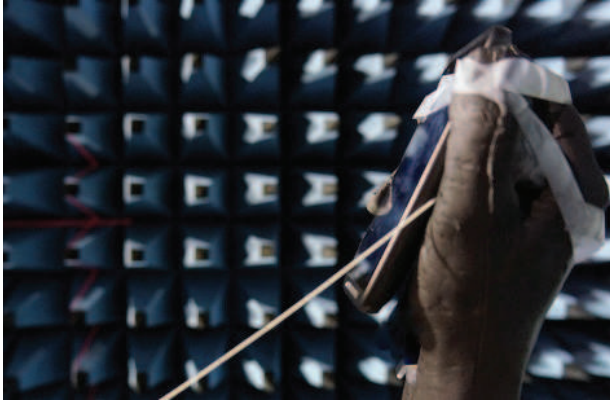
Fig. 5. Measurement set-up with optic fibers and a user's hand model.