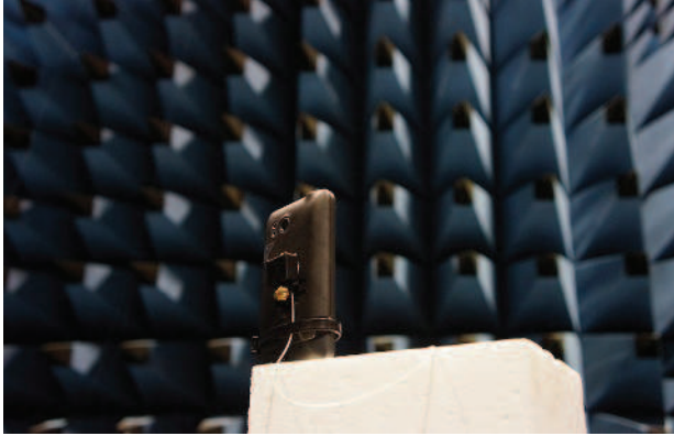
Fig. 4. Measurement set-up with optic fibers.