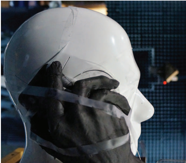
Fig. 6. Measurement set-up with optic fibers in SAM+Hand configuration.

antennas. This change in the radiation dramatically affects the computed correlation. The correlation coefficient being an essential metric for MIMO performances must be calculated with the undisturbed radiation patterns, this is without the metallic coaxial cable attached to the phone as demonstrated in the measurements. At a first glance, the measurements indicated high isolation of A1 and A2 and low correlation between them with coaxial cables. These results tend to indicate that the proposed phone is a very good candidate for MIMO operation. But it appears with further investigation that the very poor matching of the antennas and the very low efficiencies are the reason of the high isolation. Furthermore the low correlation value is measured when using a cable set-up. The actual correlation, without disturbing the radiated fields, is considerably higher and would rank the phone as less suitable for MIMO use.