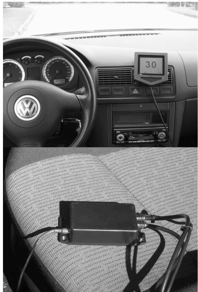
Fig. 3. The ISA equipment consisting of the display in the air nozzle (above) and the On Board Unit (below).

Each driver has a personal key ID which must be shortly in contact with the display when initiating a trip. Fig. 3 shows the ISA equipment.