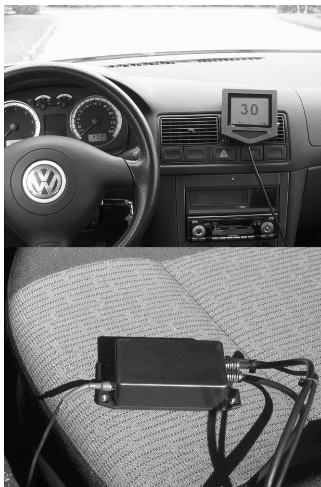
Fig. 3. The ISA equipment consisting of the display in the air nozzle (above) and the On Board Unit (below).

Each driver has a personal key ID which must be shortly in contact with the display when initiating a trip. Fig. 3 shows the ISA equipment.