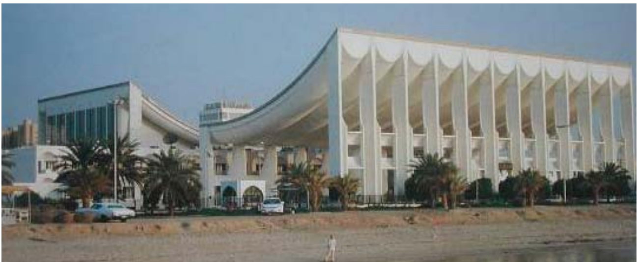
Kuwait National Assembly

Seemingly floating above the podium, the Sydney Opera House's signature sail-like roof shells were expressed by Utzon in his conceptual sketches as being like clouds hovering above the sea, both as experienced in nature and as evoked in ancient Chinese temple roofs floating above a stone base. While the choice of ceramic tiles to accentuate the sculptural character of the shells, owes its inspiration to one of Utzon's favourite buildings, the Great Mosque in Isfahan, Iran. The dynamic shimmering quality of the Sydney Opera House shells, which earned it the epithet The Other Taj Mahal , was achieved using a combination of matt and glazed ceramic tiles, specially developed to emulate freshly fallen snow; an appealing quality in the heat of a Sydney summer and one that gives the building a sense of depth in its materiality. As according to Pallasmaa, the use of such natural materials "allow the gaze to penetrate their surfaces and they enable us to become convinced of the veracity of matter" (Pallasmaa, 1994, p29).