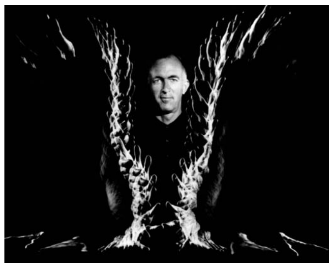
Jørn Utzon: Photo Jozef Vissel

Whether standing within the cave-like interior of Can Lis with deep sandstone walls framing Rothko-like images of sea and sky; looking up at the cloud-like chiaroscuro of the concrete ceiling folds of Bagsvaerd Church; being shaded by the seemingly billowing concrete canopy of the Kuwait Assembly Building or ascending the dramatic monumental podium stairs towards the swelling sails of the Sydney Opera House shimmering brilliantly against the sky, one fully senses that Jørn Utzon was exemplary in creating an architecture that gives us an existential sense of being in the world, between earth and sky.