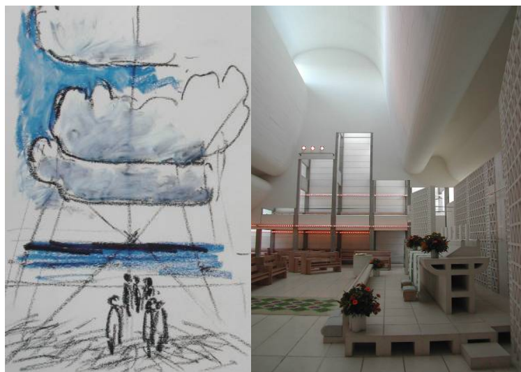
Conceptual sketch and interior Bagsvard Church, Denmark

Utzon not only uses nature as a source for structural analogy, as in his reference to palm fronds providing the inspiration for the ribs of the Sydney Opera House shells or the joints of birds wings in flight for the intended window mullions. With his artistic sensitivity Utzon also finds universal poetic metaphors in nature, as sources of creative inspiration. The image of clouds is a strongly recurring motif in Utzon's work, as exemplified by Bagsværd Church, where the interior is conceived as a spiritual space for the congregation to gather beneath billowing concrete ceiling vaults, as if under rolling clouds, through which diffused light enters.